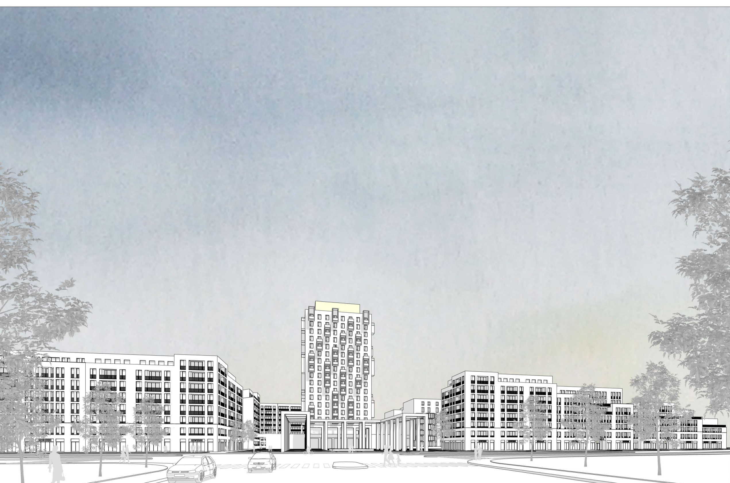
BLICK VON DER HAUPTSTRASSE KOMMEND