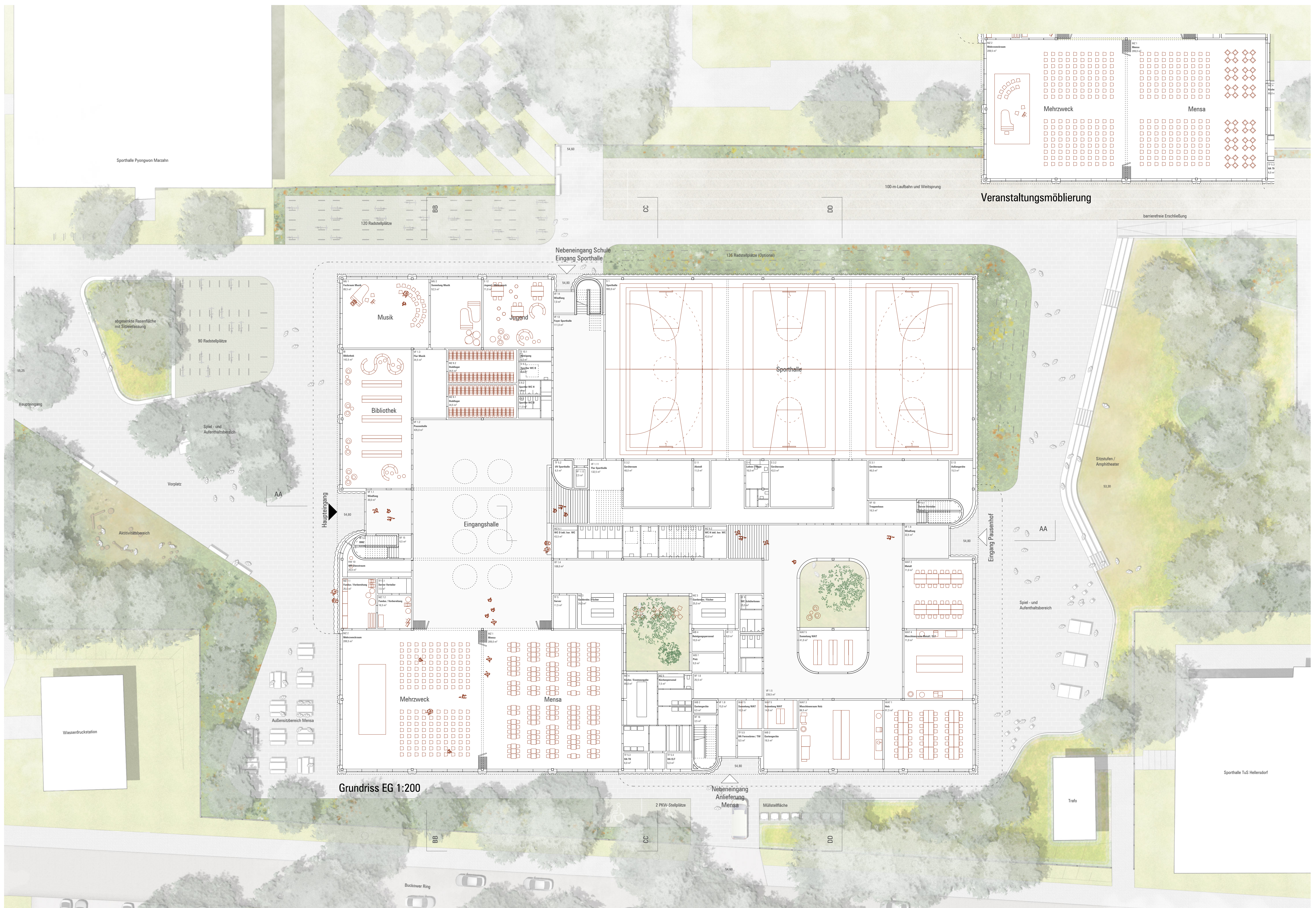
Grundriss EG 1:200