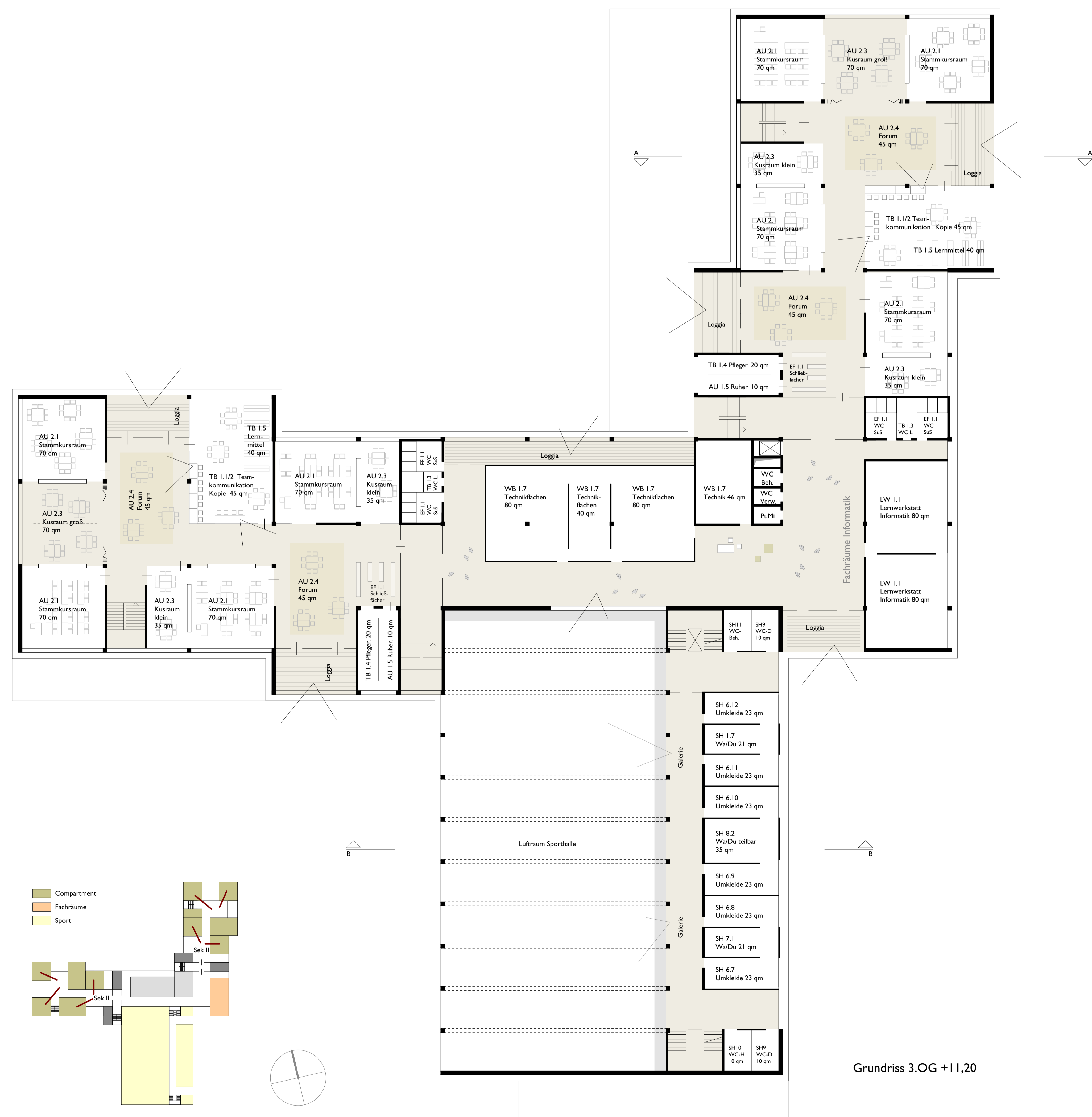
Grundriss 3.OG +I,20